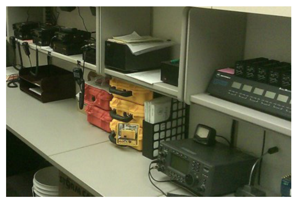
Redundant communications equipment

Telecommunications is the transmission of information by various types of technologies over wire, radio, optical, or other electromagnetic systems.