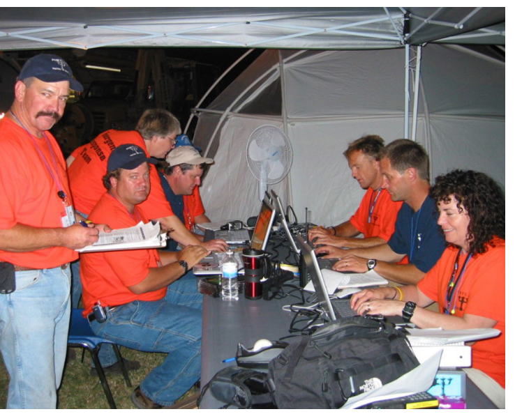
Disaster response may involve changes to normal routines. Operating out of tents, water utility responders found that laptops, cell phones, and radios, along with their chargers, were essential in supporting the response to Hurricane Katrina.