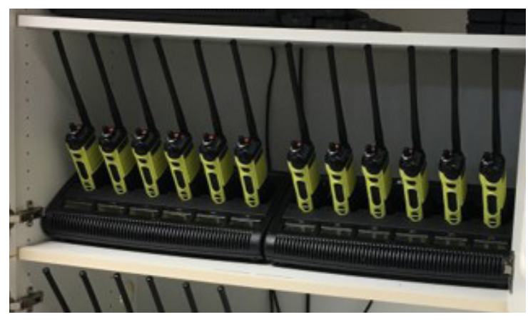
Radios ready for use